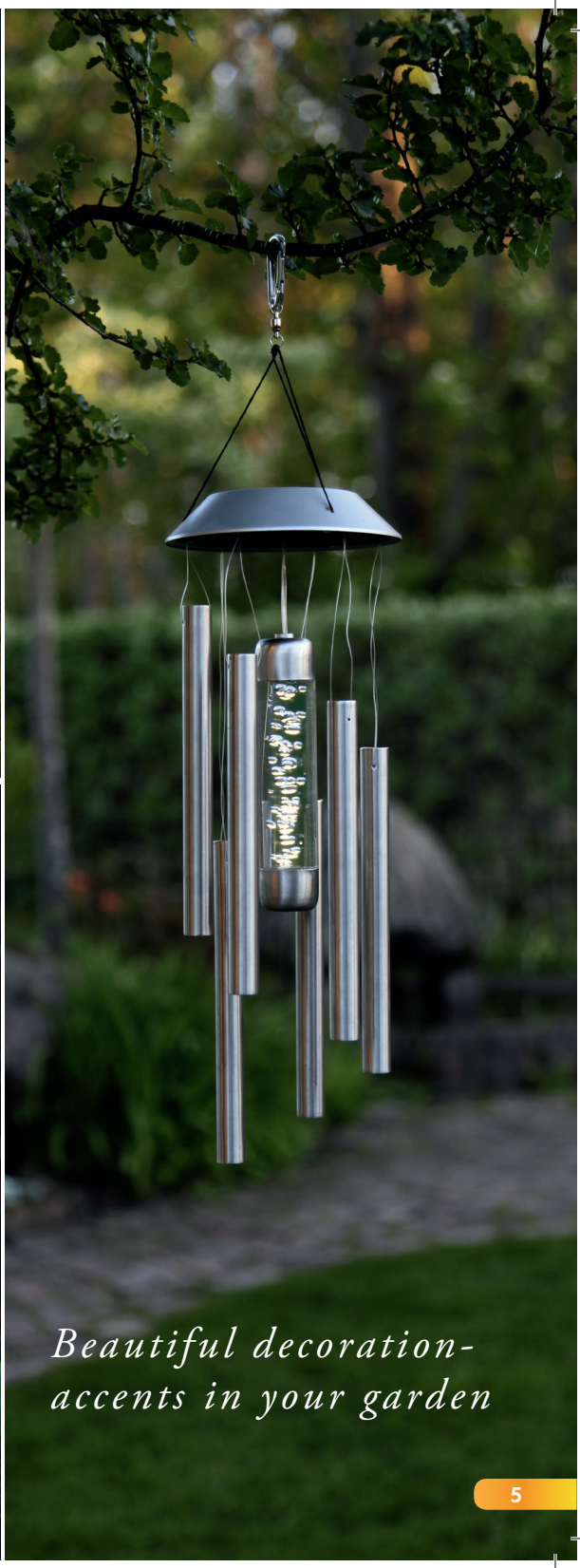
Beautiful decoration- accents in your garden