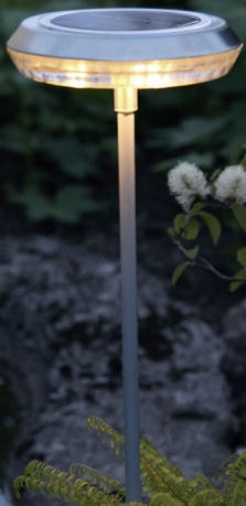
Atmosphere & Inspiration